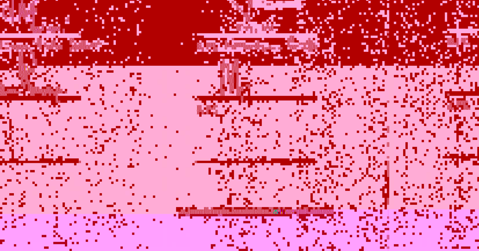
Figure 4: A photograph of a large, multi-story building with a prominent central tower, likely a school or institutional building, with a large sign in front.